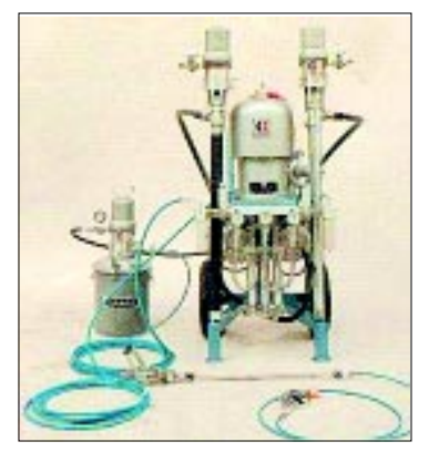
TYPICAL SPRAY EQUIPMENT FOR BELZONA® 1522