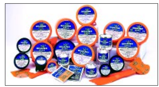
BELZONA® 1000 SERIES METALLIC POLYMERS