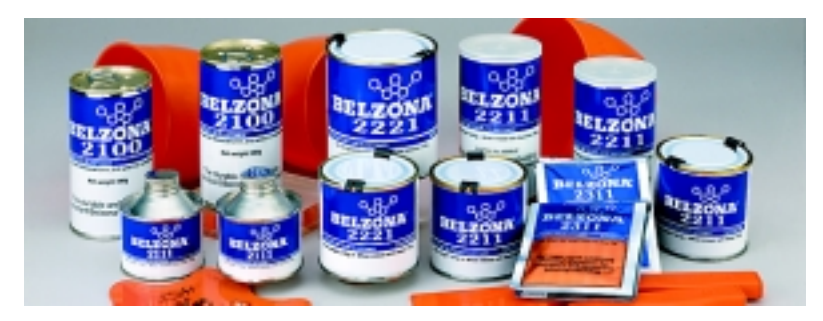
BELZONA 2000 SERIES ELASTOMERIC POLYMERS