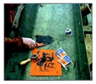
HOLED CONVEYOR BELTS